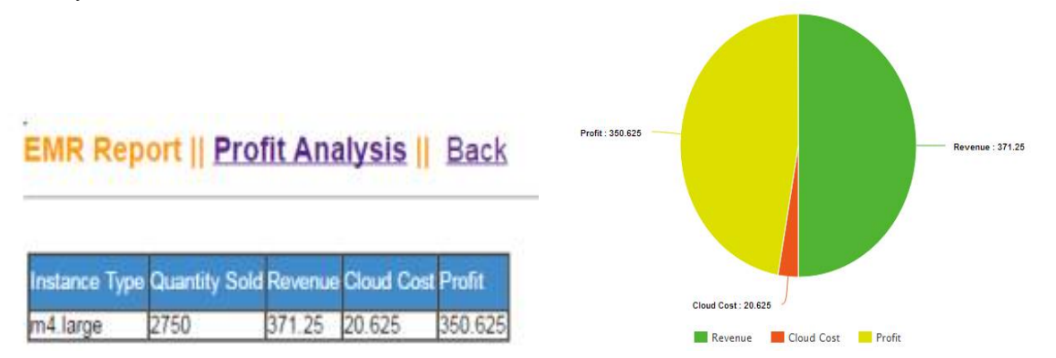
Fig3:EMR Profit Analysis

The result table and pie chart shows revenue generated by the intermediary.In EMR revenue generated by intermediary is 371.25 and cost paid to cloud is 20.625 so approximate profit to intermediary is 350.625 which is almost 94 % of total revenue. In EC2 revenue generated by intermediary is 120 and cost paid to cloud is 60 so approximate profit to intermediary is 60 which is almost 50 % of total revenue.